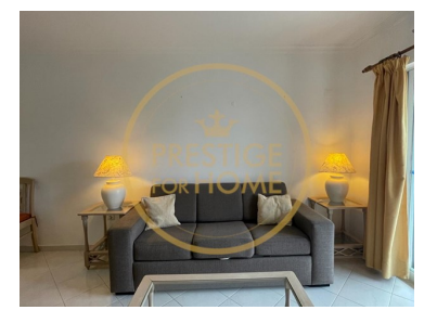
= 2 Bedrooms